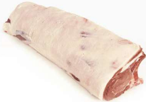
1 Loin of pork without the fillet. Rind removed.