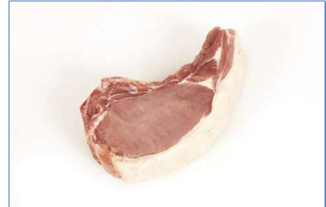
3 Chop – Loin (part vertebrae removed)